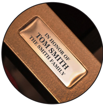
Actual plaque size is 4 in. x 1-1/4 in.

Please print the exact text for each engraved plaque. Print up to three lines for each seat, with a maximum of 20 characters and spaces per line. (Please make additional copies of form as needed.)